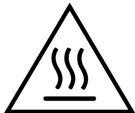
Attention: Hot surface